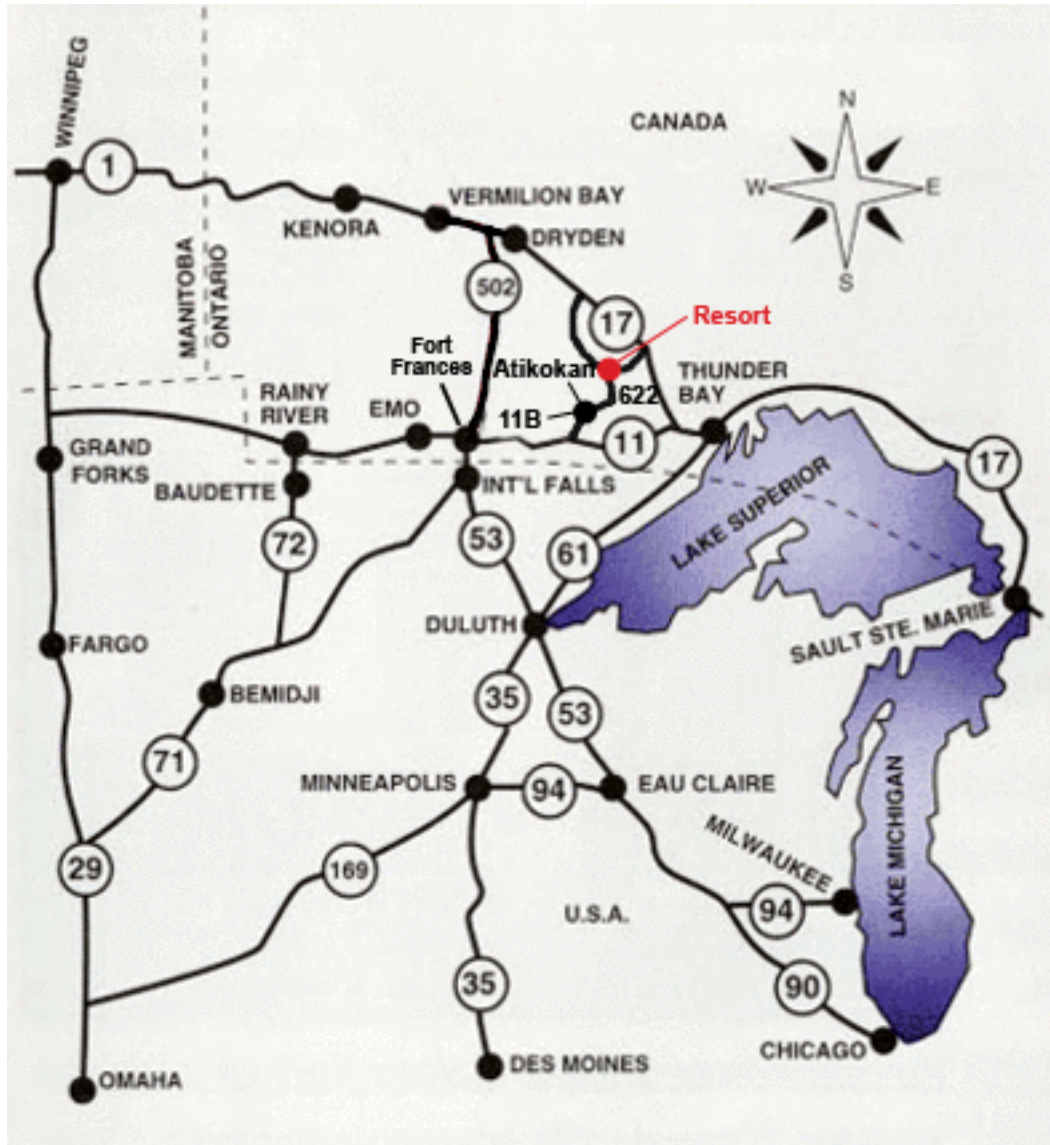
Finlayson Lake Resort and Campground is located on Finlayson Lake, 13 miles (20 KM) north of Atikokan on Highway 622. Watch for the Provincial signs.